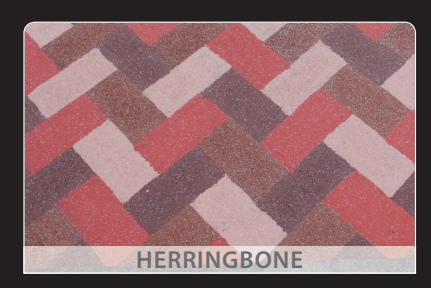
Color Combinations are not interchangeable