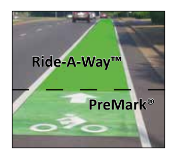
White symbols must be retroreflective. A PreMark® legend, arrow or bike panel integrates easily at specified intervals while maintaining pleasing color consistency.

Ride-A-Way™ is an epoxy-modified, water-based acrylic coating specifically designed for long-term use under appropriate conditions and proper placement. Application is simple by building the thickness through spraying and brooming in four layers using an air atomized sprayer.